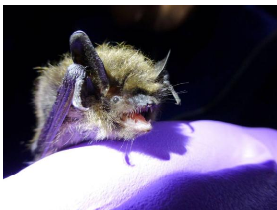
Photo 2: Male Whiskered Bat ( Myotis mystacinus ) caught in Penyard Park Wood in June 2013

Mist netting and harp trapping are also benefiting our members; providing experience in handling, bat identification, and recording biometrics.