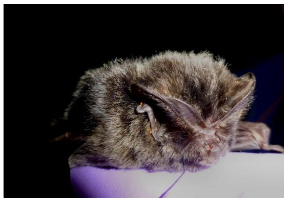
Photo 1: Male Barbastelle ( Barbastella barbastellus ) caught in Chase Wood in May 2013 (Photo courtesy of David Lee).

The two surveys performed in May were extremely cold so bat activity was minimal. However six species were detected in each woodland, including Barbastelle ( Barbastella barbastellus ), Natterer's ( Myotis nattereri ), Whiskered ( Myotis mystacinus ) and Lesser Horseshoe ( Rhinolophus hipposideros ). Two interesting bats were caught in our nets, a male Barbastelle ( B. barbastellus ) caught in Chase woods (Photo 1) and a Whiskered bat ( Myotis mystacinus ) in Penyard Park (Photo 2).